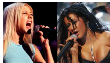
Celebrity Teens: From Mild to Wild