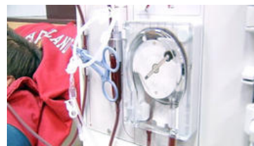
Dialysis Danger: Why Location Matters for Some Patients