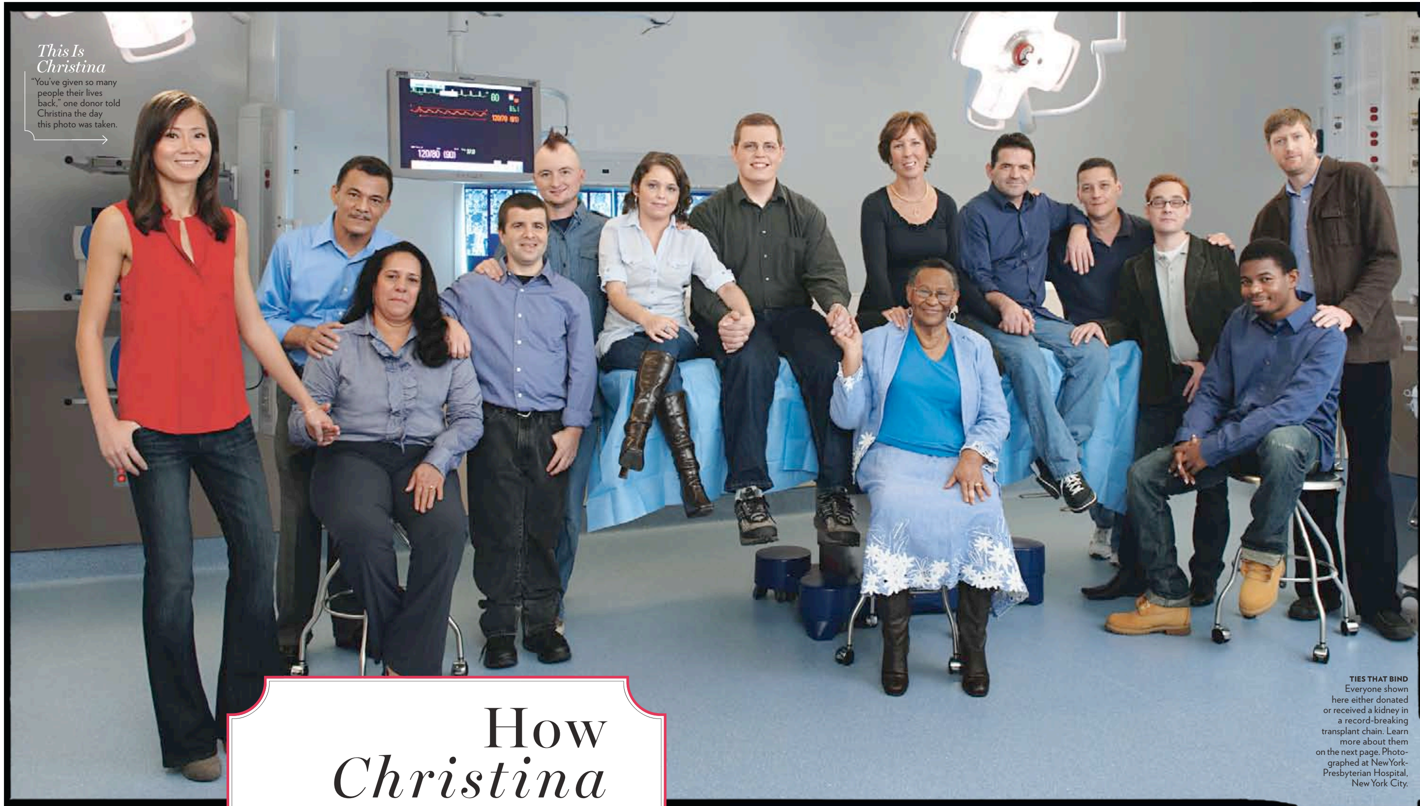
TIES THAT BIND Everyone shown here either donated or received a kidney in a record-breaking transplant chain. Learn more about them on the next page. Photographed at NewYork-Presbyterian Hospital, New York City.